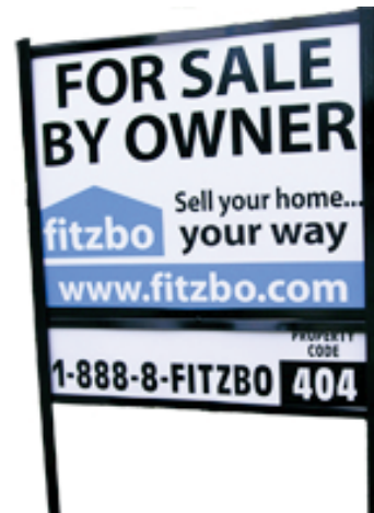
Yard sign $50