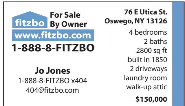
Fast Facts business cards $50